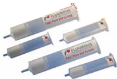
Table 1: F-SPE CARTRIDGES LOADING CAPACITY