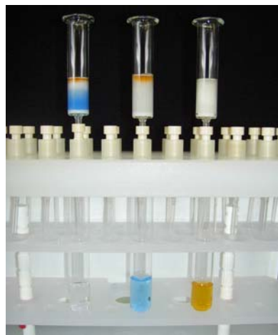
Figure 1. F-SPE with Blue (Organic) and Orange (Fluorous) Dyes